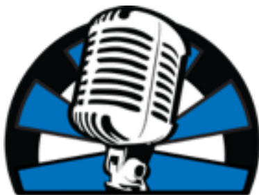
The SpeakerCareer.com Kick-Start Guide Module 1 Action Guide

Please copy your answer to #3 into the comments section on the training video's page at https://speakercareer.com/video-series/10k/